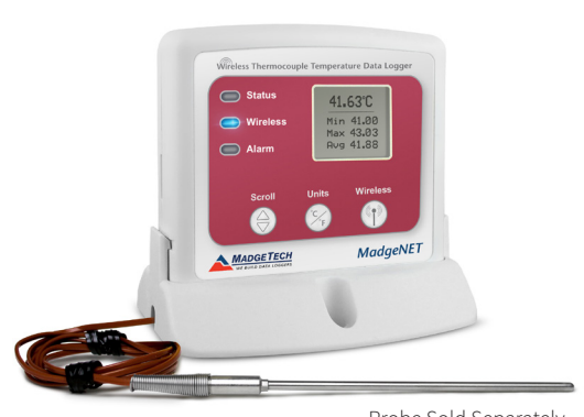
Probe Sold Separately